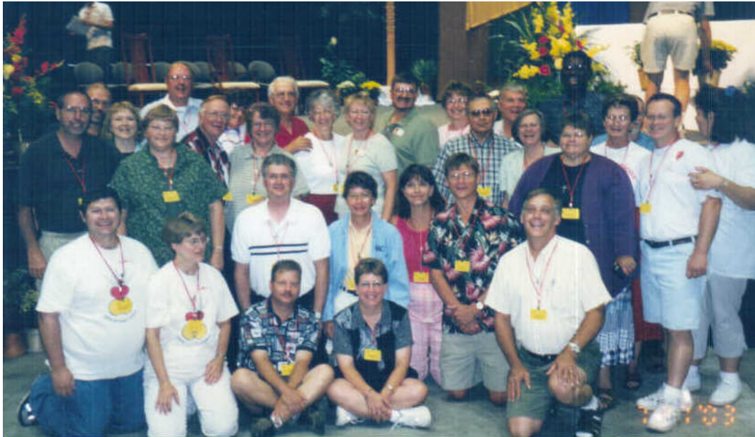
Iowa ME couples who attended the convention